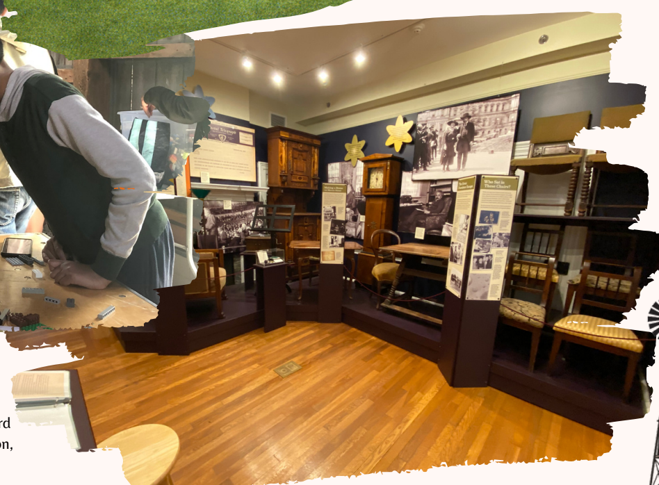
Back Cover Images: Einstein self-portrait, historic postcard image of Princeton University, family at Building Princeton, HSP's Einstein Salon exhibition

All images used reflect HSP's collections and programs