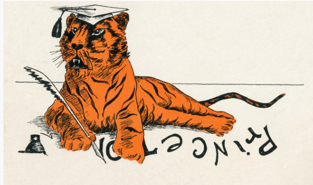
Historic Princeton University postcard