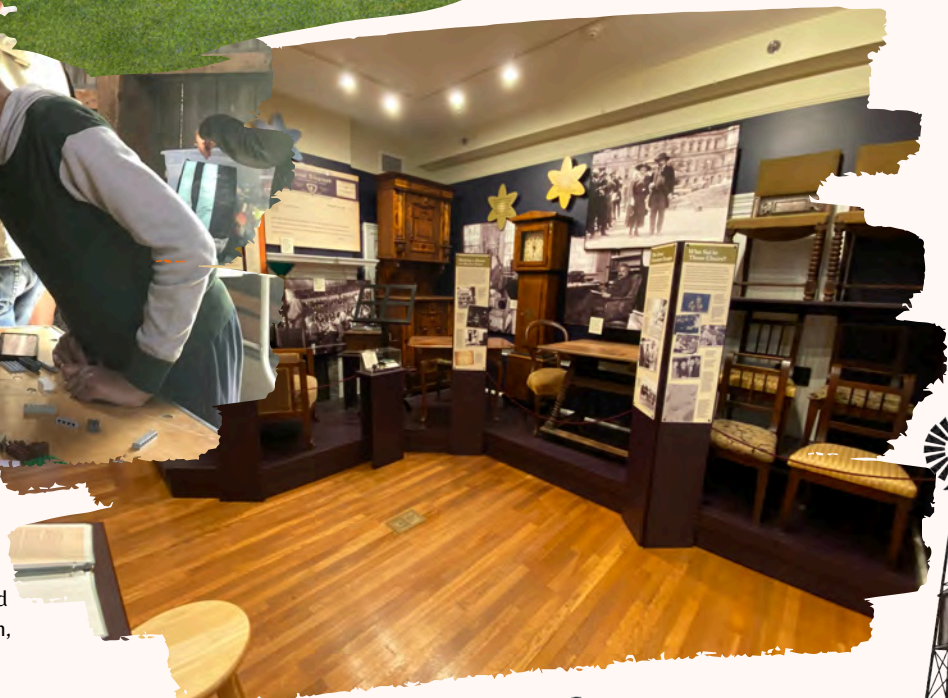
Back Cover Images: Einstein self-portrait, historic postcard image of Princeton University, family at Building Princeton, HSP's Einstein Salon exhibition

All images used reflect HSP's collections and programs