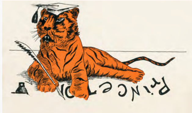
Historic Princeton University postcard